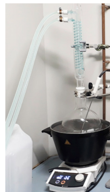
Fig. 1 Water cooled reflux system

Water cooled: In a predominant number of cases, tap water is used as coolant. Like a water sheath, it flows around the reflux column on the inside of which the boiling vapor rises. Convexities on the inner side walls of the column or cooling coils enlarge the cooling surface. (Fig. 1 Functional principle of a water cooled reflux condenser)