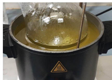
A precise temperature control of the reaction is only possible by means of use of an external temperature sensor