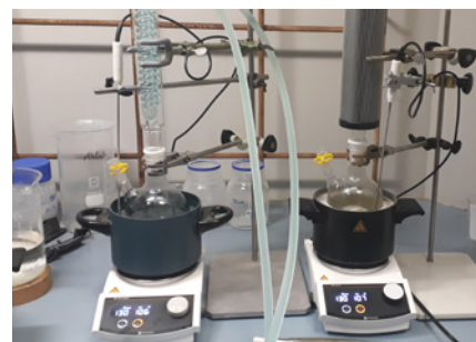
Safety in the lab: Findenser™ (on the right side) takes less space in the fume hood

Heidolph Magnetic Stirrers Heidolph Findenser™